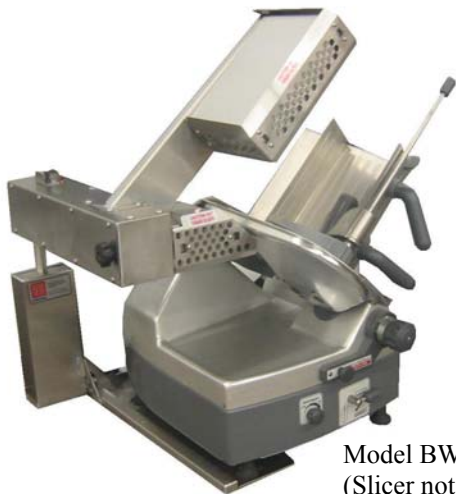
Model BW4B (Slicer not included)

The Marshall Model BW4B Slicer Warmer features patented ThermoGlo™ heating technology. Heat radiates from every square inch of the upper and lower flat plate surfaces maintaining uniform holding temperature and improved moisture retention for up to 45 minutes. The upper heat plate centers over the meat while the lower plate provides heat to the sliced meat as it falls on to the slicer landing area.