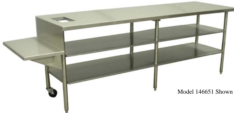
Model 146651 Shown

The Marshall Heated Sandwich Wrap Table top surface provides a uniform heat surface side to side and keeps food warm during preparation.