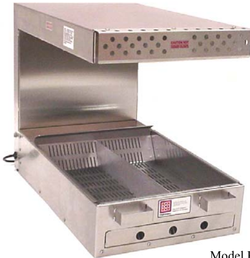
Model RR5C Shown

Marshall's custom built Fried Foods Dump Station incorporates ThermoGlo™ technology and can be used for holding and warming a variety of other food products.