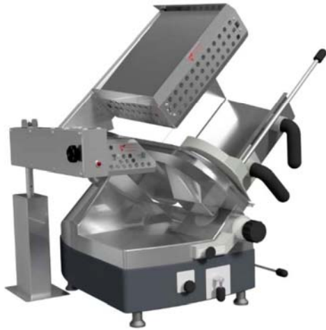
Model BW4B-1 (Slicer not included)

The Marshall Model BW4B-1 Slicer Warmer features patented ThermoGlo™ heating technology. Heat radiates from every square inch of the upper and lower flat plate surfaces maintaining uniform holding temperature and improved moisture retention for up to 45 minutes. The upper heat plate centers over the meat while the lower plate provides heat to the sliced meat as it falls onto the slicer landing area.