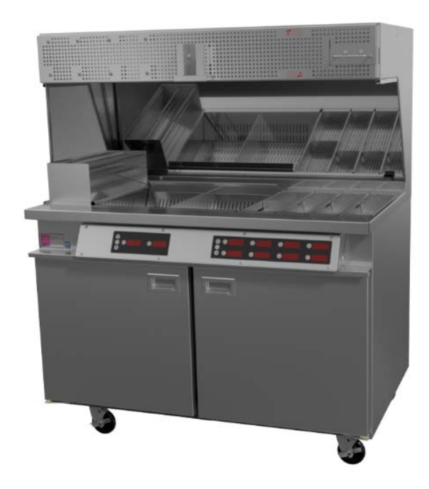
Model RR5-48.5LT (dump left shown)

The Marshall Models RR5-48.5 and RR5-42 Fry Dump Stations feature our ThermoGlo<sup>™</sup> heating technology. Heat radiates from every square inch of the upper flat plate heating surface. This eliminates the need to clean intricate cal-rod, wire and reflector assemblies. There is also auxiliary bottom heat. This dump station includes four organizers and a fry dump pan with a bagged fry holder.