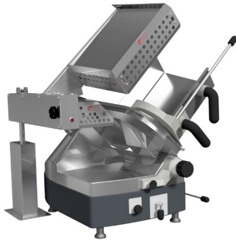
Model BW4B-1 (Slicer not included)

The Marshall Model BW4B-1 Slicer Warmer features patented ThermoGlo™ heating technology. Heat radiates from every square inch of the upper and lower flat plate surfaces maintaining uniform holding temperature and improved moisture retention for up to 45 minutes. The upper heat plate centers over the meat while the lower plate provides heat to the sliced meat as it falls onto the slicer landing area.