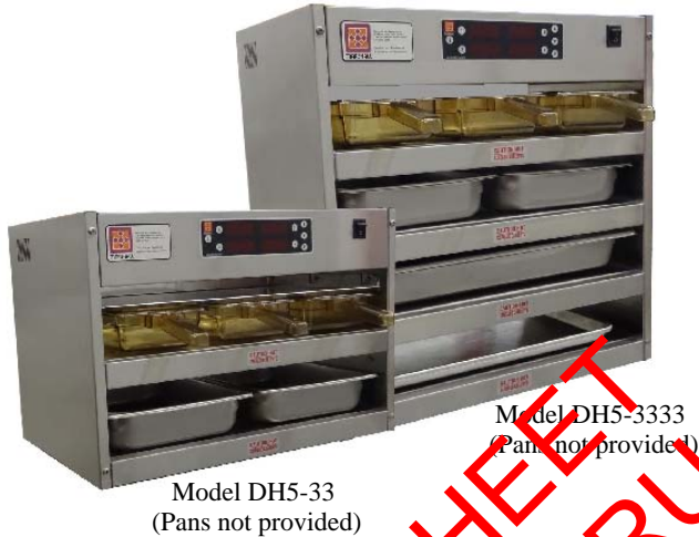
Model DH5-33 (Pans not provided)