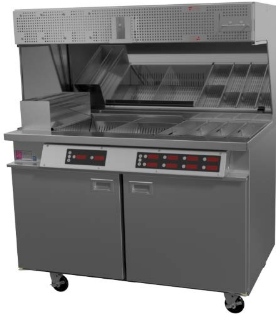
Model RR5-48.5LT (dump left shown)

The Marshall Models RR5-48.5 and RR5-42 Fry Dump Stations feature our ThermoGlo™ heating technology. Heat radiates from every square inch of the upper flat plate heating surface. This eliminates the need to clean intricate cal-rod, wire and reflector assemblies. There is also auxiliary bottom heat. This dump station includes four organizers and a fry dump pan with a bagged fry holder.